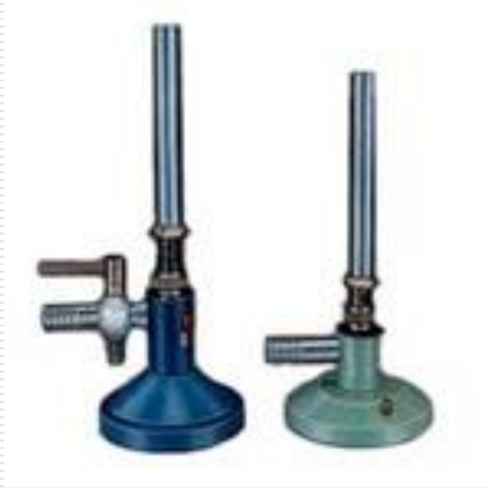
□ Bunsen Burner