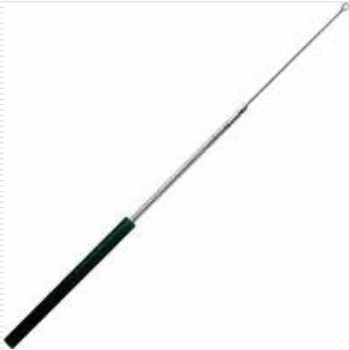
□ Inoculation loop