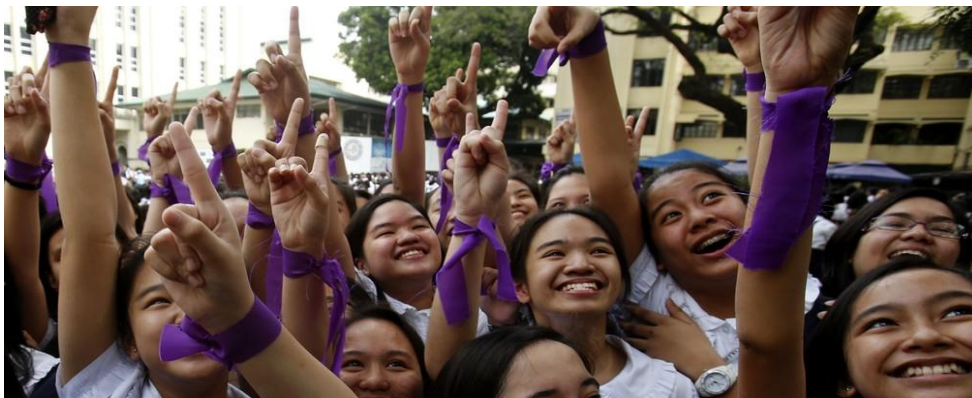
Figure 5: Changing the Pattern

Tracking data is one of the best ways you can remove reliance on your own faulty judgment and biases. Data can reveal trends and behavior that go against our expectations, things like pay gaps, promotion gaps, and mentorship gaps. Track employees' progress in their roles and progression through the company. How long do they spend in each role? How long does it take for them to get a salary bump? How much is that salary bump? Make sure that women and minorities are not falling behind men. A small startup might have too little data to see trends, but even tracking it will help you think about biases you might have and notice discrepancies early. Data is imperfect, but it is still less biased than the average human. Making it a part of your companies' efforts to reduce bias and discrimination is a big step toward something resembling 'objectivity'. The next thing that can be done is to try to change the pattern. Challenge the traditional ideas of how successful engineers and leaders look and behave. A successful leader can be soft-spoken and introverted. A talented engineer can be girly and socially adept.