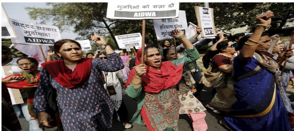
Figure 2: Women demand and investigation into rapes and sexual assaults in Haryana state.

Despite some basic changes in the status and role of women in the society, no society treats its women equally as well as its men. Consequently, women continue to suffer from diverse deprivations from kitchens to keyboards, from the cradle to the grave across nations. Historically women in India were revered and the birth of a girl was widely believed to mark the arrival of Lakshmi – the Goddess of wealth and riches. Women have been considered 'Janani', i.e., the progenitor and 'Ardhangini' i.e., half of the body. Women are also considered to be an embodiment of Goddess Durga. Women have shouldered equal responsibilities with men. Widespread discrimination against women is, however, reflected in recurrent incidents of rape, acid throwing, dowry killings, wife beating, honour killings, forced prostitution, etc. Some of these issues were highlighted by 'Satyamev Jayate' (Truth alone prevails) – an acclaimed television show hosted by Bollywood icon Aamir Khan.