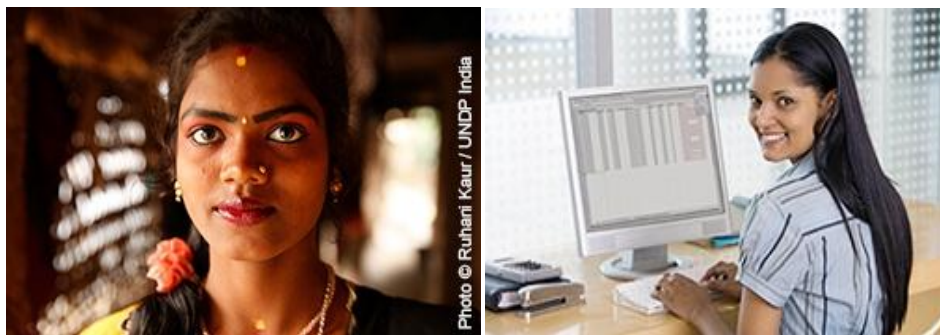
Figure 3: 2015 Picture of International Women's day

There are some striking examples of emancipation women oft quoted include the name of Meera Kumar, erstwhile speaker of Lok Sabha, Sushma Swaraj, Minister of External affairs, Chanda Kochar Chair person of ICCI Bank, Shika Sharma etc easily come to mind. Clearly, one swallow does not make a summer and more needs to be done. But the gross under utilization of women in Police, Judiciary etc are seen clearly. Gender inequalities, and its social causes, impact India's sex ratio, women's health over their lifetimes, their educational attainment, and economic conditions. Gender inequality in India is a multifaceted issue that concerns men and women alike. Some argue that some gender equality measures, place men at a disadvantage. However, when India's population is examined as a whole, women are at a disadvantage in several important ways. In India, discriminatory attitudes towards either sex have existed for generations and affect the lives of both sexes. Although the constitution of India has granted men and women equal rights, gender disparity still remains.