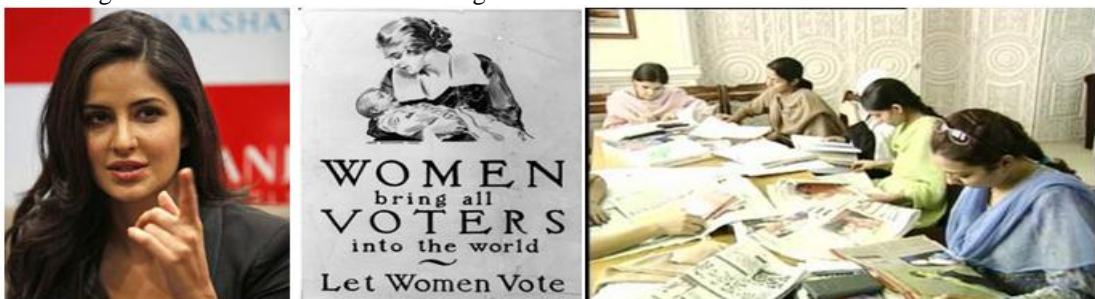
Figure 1: A representative example of changing roles

The role of women has changed in recent years. But how has it changed? There are the obvious: Changes