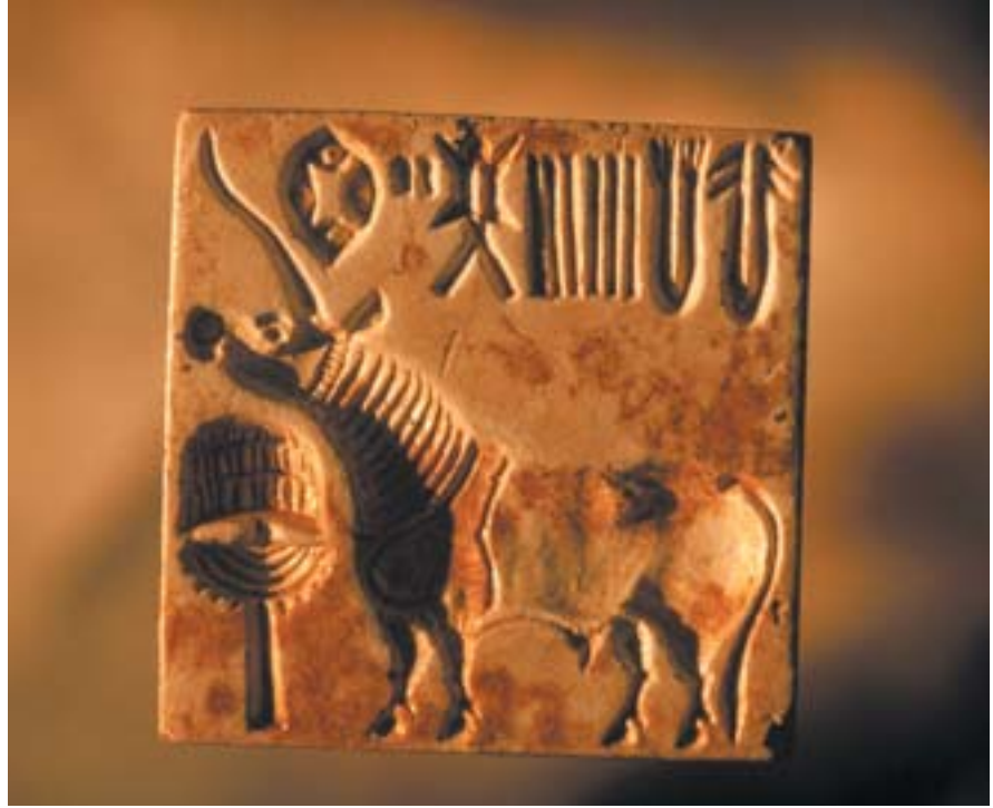
INDUS MERCHANTS stamped glazed seals bearing animal images and the undeciphered Indus writing symbols into soft clay tags attached to trade goods to indicate ownership and accounting information.

Our view of the sang changed significantly when we began digging inside the southern gateway of Harappa, just adja-