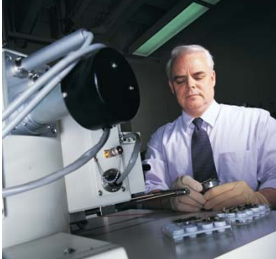
TELLTALE TOOL MARKS become visible when the author examines ancient Indus Valley artifacts with a scanning electron microscope at the University of Wisconsin–Madison.

Our discovery in 2001 of a workshop that manufactured seals and inscribed tablets at Harappa [see box on page 74], combined with the past 16 years of excavation at the site, has provided a new chronology for the development of the Indus writing. In the past, scholars had lumped all the seals and tablets together, but now we can demonstrate that differ-