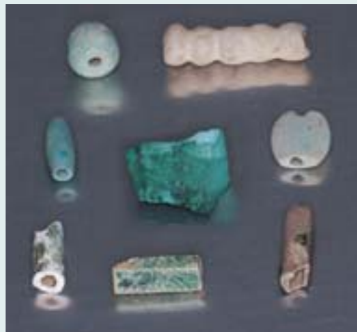
PRODUCTION of glazed stone and ceramics, known as faience, required Indus craftsmen to develop sophisticated coating and firing techniques. Copper oxide-bearing minerals (center) were added to color the silica glaze blue so that it resembled precious turquoise or lapis lazuli.

After the mini kiln had cooled down, my students and I gathered around to observe the results. Though not identical to faience objects created by Harappan master craftsmen, fully glazed faience tablets and beads resulted. This first attempt of ours indicates that the canister-kiln technique would have been a highly efficient method for producing faience and fired steatite objects. Even more important was that the remains of the process—a pile of charcoal and ash, a cracked firing container, some discarded conical supports, charred bone, and a few rejected beads and tablets—closely resembled what we had found in the workshop at Harappa. —J.M.K.