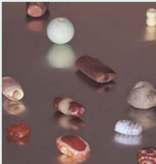
MASTER ARTISANS of the Indus used complex grinding, drilling and decorating methods to fashion colored minerals, often imported from far afield, into exquisite beadwork.

But the drilling of beads did not stop. Later artisans began perforating stone with hollow tubular copper drills used in combination with abrasives. The Harappans had always employed this method for hollowing out large stone rings and alabaster vessels, but then they miniaturized the technique, working with tiny tubular drills only a millimeter in diameter. Though not as efficient as Ernestite drills, the copper drills could perforate relatively hard stone beads by working halfway through from each side. —J.M.K.