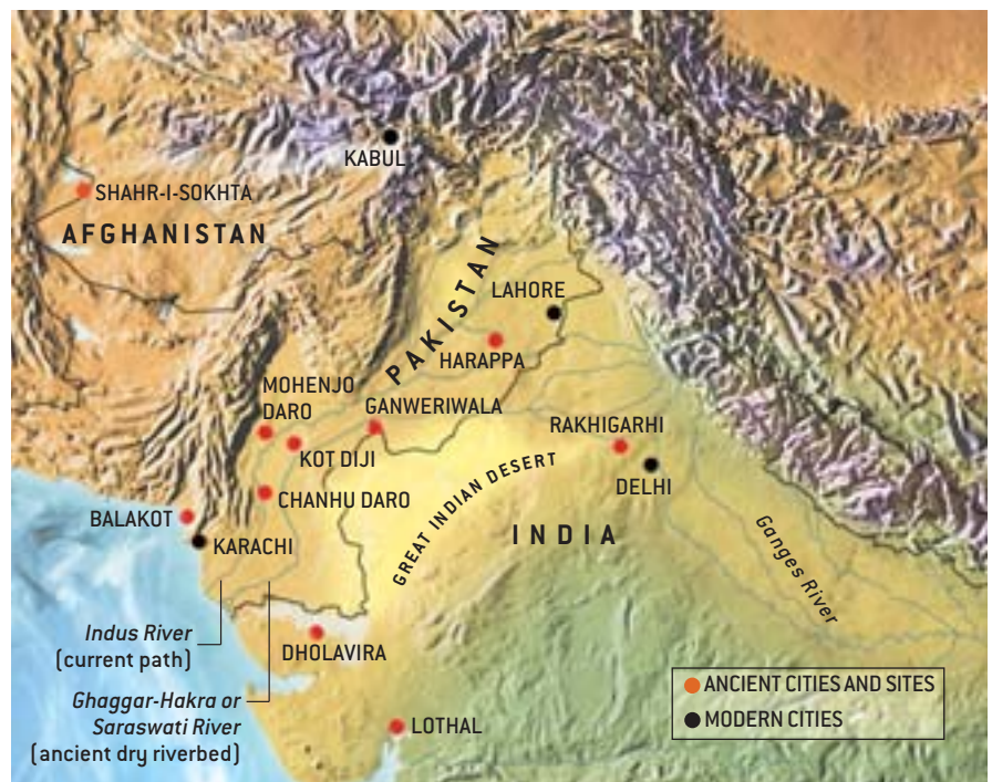
INDUS VALLEY CIVILIZATION, which arose some 4,800 years ago, eventually included more than 1,500 cities and settlements spread over an area the size of western Europe in present-day Pakistan and western India.

Archaeologists have found other small farming communities from this period to the north and south of Harappa along the Ravi River, but none of these hamlets expanded into a larger town. In the limited exposed area of the Ravi-period Harappa, investigators have turned up signs of the production of both terra-cotta and stone beads and bangles. The terra-cotta items were probably worn by children or commoners, or both, whereas the more exotic stone and seashell ornaments most likely adorned local upper-class populations. Through careful analysis of the raw materials and comparison