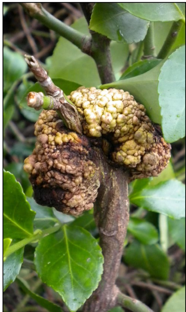
FIGURE 1. CROWN GALL TUMORS, SUCH AS THIS ONE ON EUONYMUS, ARE INITIALLY WHITE AND FLESHY IN APPEARANCE.

On many hosts, tumors begin as spherical structures (FIGURE 2). Secondary galls can be more irregular in shape. In the case of grape, a series of very small galls may form underneath bark tissue (FIGURE 5). Galls may not initially be evident (FIGURE 6) until bark splits and peels as a result of gall enlargement and expansion.