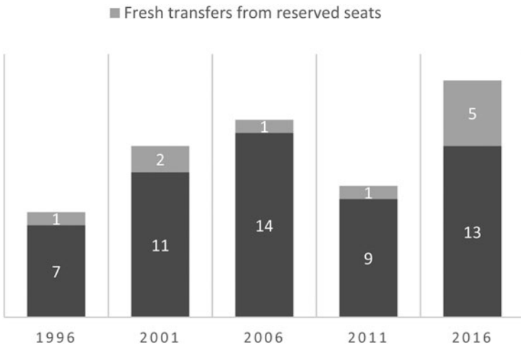
Figure 2 Female constituency MPs in Uganda by election year. Sources: Muriaas & Wang (2012: 312–14); Electoral Commission of Uganda (2016). Note. Fresh transfers in 2016 included one transfer by a female youth representative.

This gendered perception affects not only the decision of female MPs to run for election to an open seat, but also affects party nominations and voters’ decisions. In addition, unlike in Tanzania, Uganda’s executive branch and ruling party do little to encourage quota MPs to switch to open seats. Figure 3 summarises our argument above and serves as a framework of our analysis.