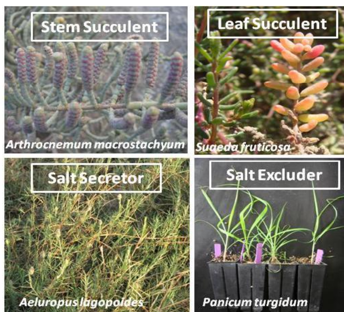
Fig. (2). Some adaptations of halophytes.

direct relation between increased antioxidant defense and salt tolerance has been reported for halophytes [16, 35-36].